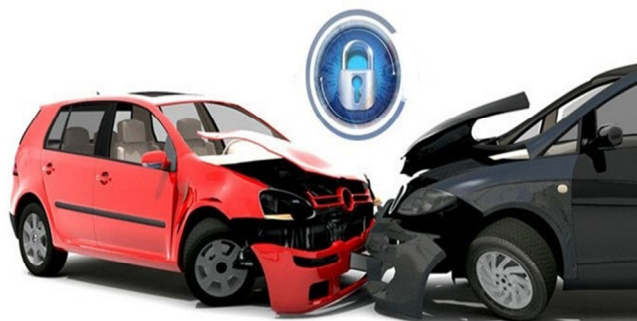
Figure 4 accident detecting sensor