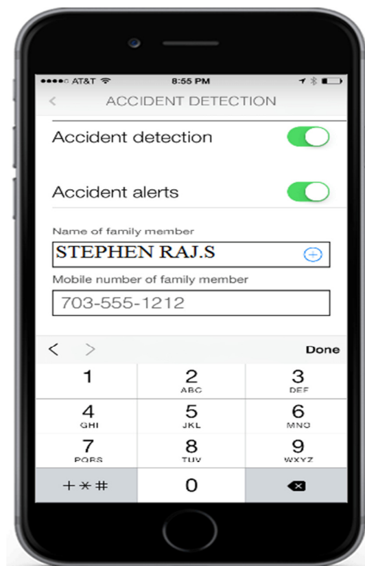
Figure 1 accident detection sender

GSM Modem can allow any SIM card as like a cell phone handset with its have important phone number. Applications like location power, data convey, remote direct and sorting can be developed simply. The modem can also be connected to PC series port straight. Heartbeat strange circumstance while detected then this communication is send to relation as well as ambulance, monitor station with spot using GPS method [4][9].